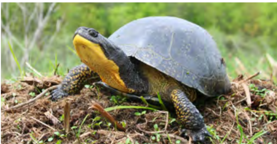
Blanding's Turtles vs. Windmills