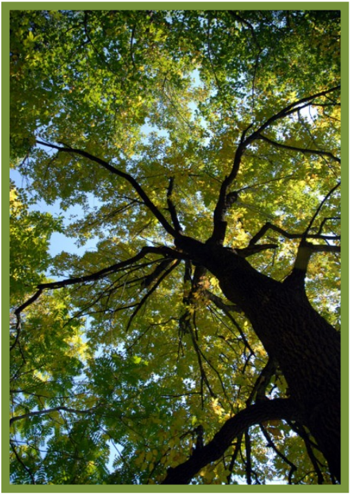
Presented by: Hastings Stewardship Council